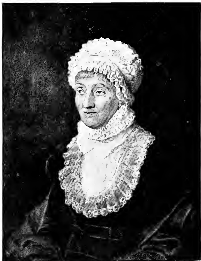
CAROLINE LUCRETIA HERSCHEL.