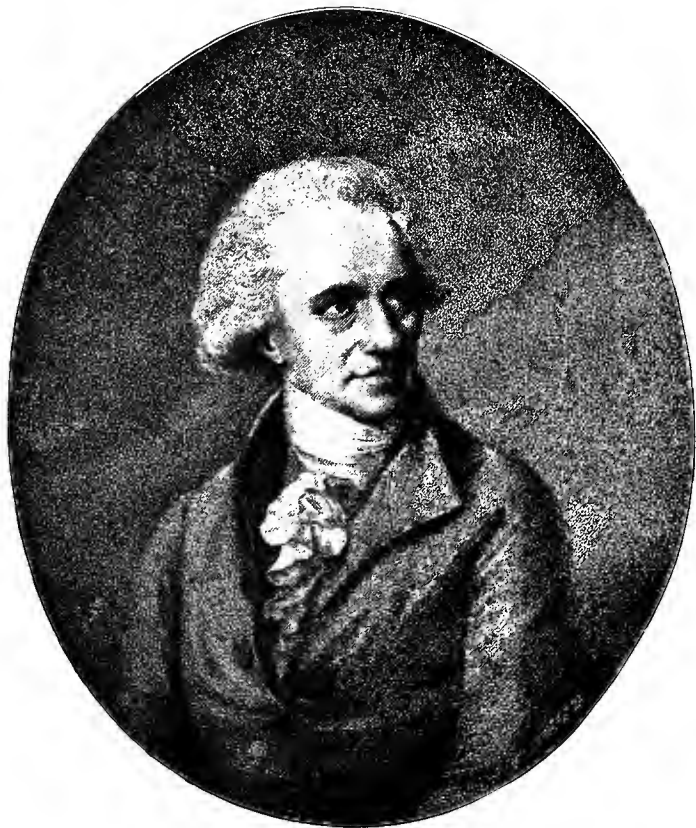
SIR WILLIAM HERSCHEL.