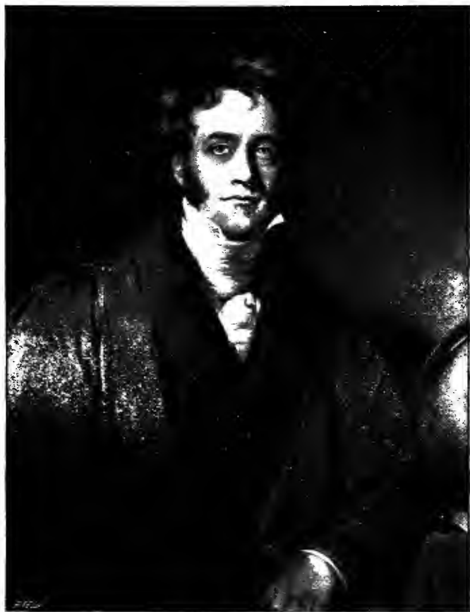
SIR JOHN FREDERICK WILLIAM HERSCHEL, BART.