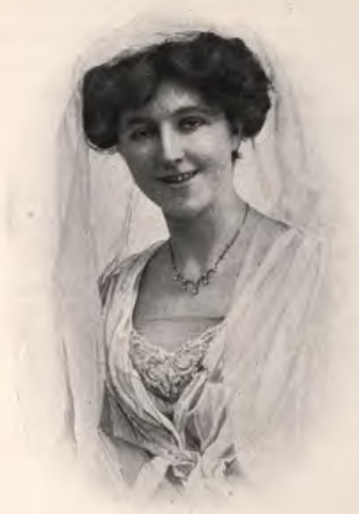
THE AUTHOR IN PRIVATE LIFE *