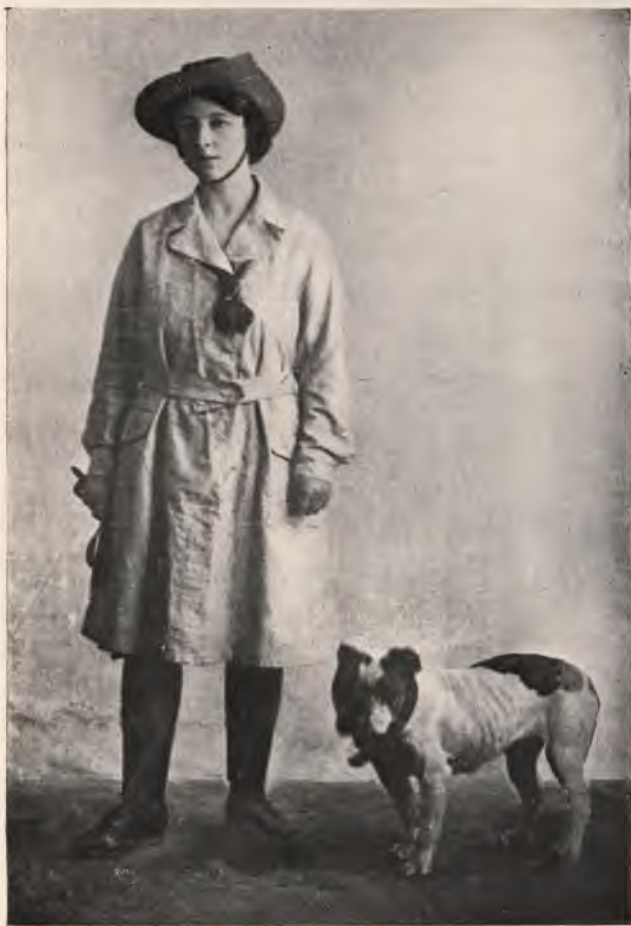
THE AUTHOR ON LAND ARMY WORK