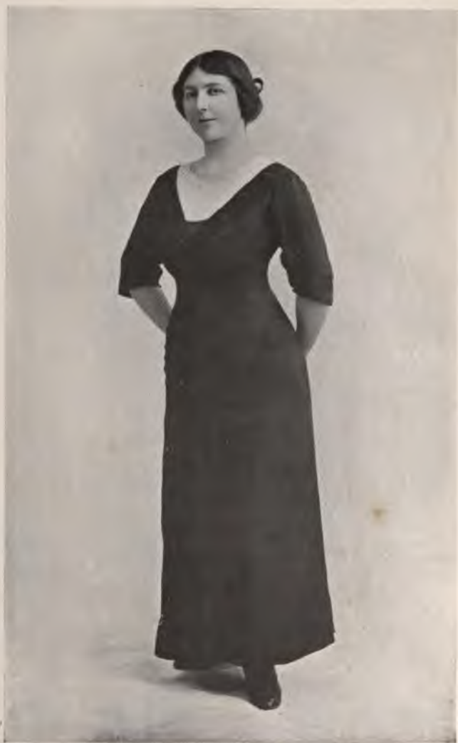
THE AUTHOR IN PRIVATE LIFE