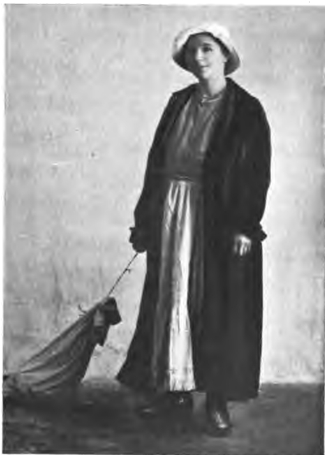
THE AUTHOR IN SENLIS FORESTS