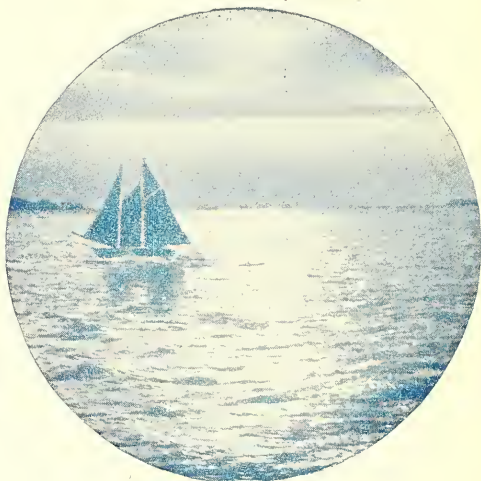
THE GOLDEN GATE, S. F.