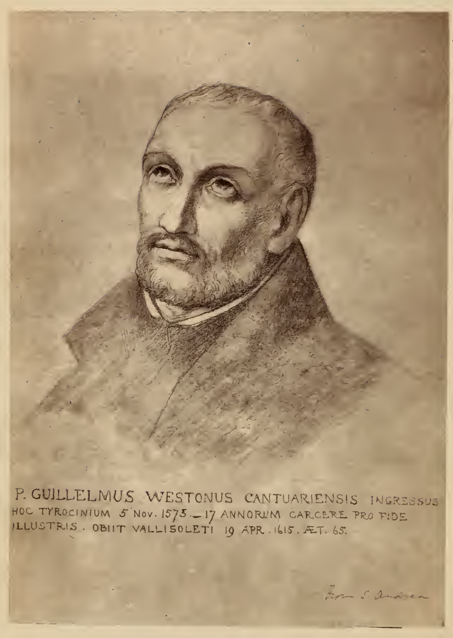
FATHER WILLIAM WESTON, S.J.