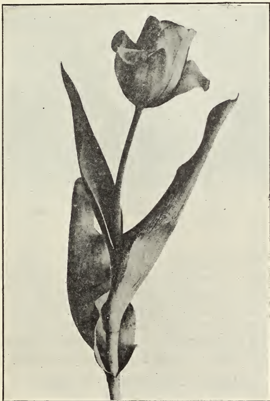
FIG. 3.—Blossom of tulip.

The narcissus with large trumpets and flat leaves is commonly called the daffodil. Jonquils have glossy, dark-green, very narrow, three-cornered, or rushlike leaves. Most of the intermediate forms are hybrids. New varieties are originated by growing bulbs from seed resulting from crossing one type with another. This is a slow process, as several years are required to produce a mature bulb from seed.