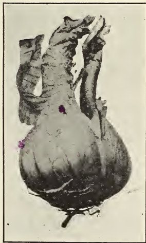
FIG. 2.—Bulb of narcissus.

If they are to be grown in pots or window boxes, light, rich soil should be used. Place 1 to 2 inches of cinders or broken pots in the bottoms of the pots or boxes to insure good drainage. After planting, place the pots or boxes out of doors and cover them with about 4 inches of ashes or sand; or they may be placed in a dark, cool room or cellar for a few weeks until the bulbs have formed a quantity